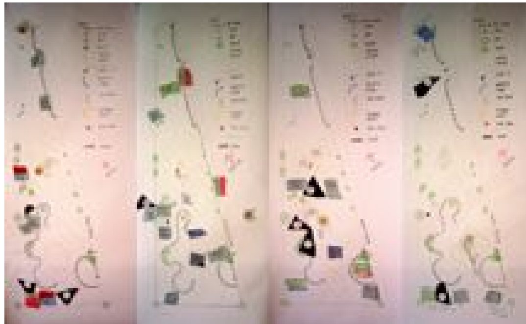
Figure 1. Maps produced at the Spring Equinox gathering